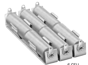
6 CELL CAT. NO. 193 CAT. NO. 197