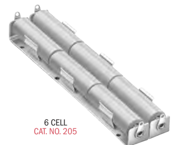
6 CELL CAT. NO. 205