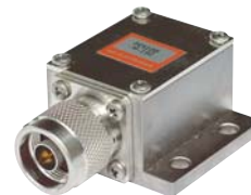
SMA OR N CONNECTORS 150, 250 & 500 WATTS

KEY: Inches [Millimeters] .XX ±.03 .XXX ±.010 [LX ±0.8 .XX ±0.25]