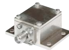
SMA 50 & 100 WATTS