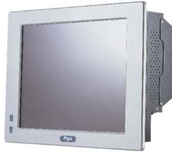
17" Panel Front View