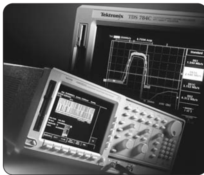
▶ The AWG520 can easily generate telecom signals which complement masks from a digital oscilloscope.

The AWG520's unique design combines a graphical editing display with powerful output capabilities to simplify the creation of arbitrary and complex waveforms and enable easy on-screen waveform editing. With the AWG520's many built-in intuitive and powerful features, you can easily develop and edit custom waveforms. Option 03 adds an independent 10-bit-wide digital data port that can be used in conjunction with marker outputs for data generation up to 14-bits wide at up to 1 GHz (14-bits, AWG520). Direct waveform transfer capability makes the AWG520 the perfect complement to selected Tektronix oscilloscopes.