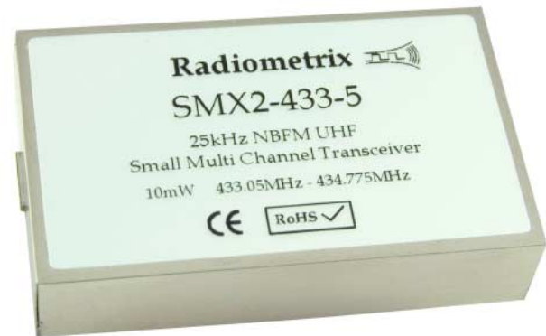
Figure 1: SMX2-433-5

SMX2 is small multi-channel UHF transceiver operating on 433.05MHz-434.79MHz European licence exempt band. SMX2 offers a fast-route to custom frequency on any UHF band from 431MHz to 436MHz with 25kHz channel spacing.