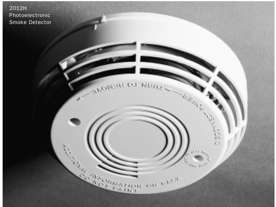
2012H Photoelectric Smoke Detector

A77-727-01 12 VDC power supply (required for system to be UL listed)